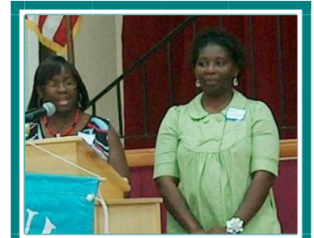
Two of our scholarship recipients speaking to us.